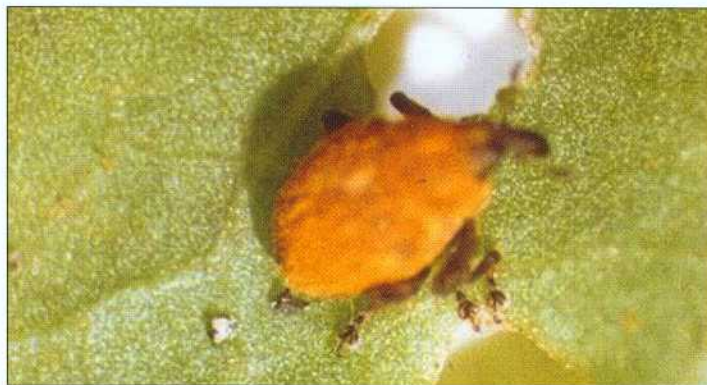
An adult weevil, Rhinoncomimus latipes , has been released as a biological control agent against mile-a-minute weed in New Jersey and Delaware.

Glyphosate applied at a low rate will probably be effective in killing mile-a-minute weed. Prior approval and recommendations should be obtained from the department of agriculture in the state where the application will take place.