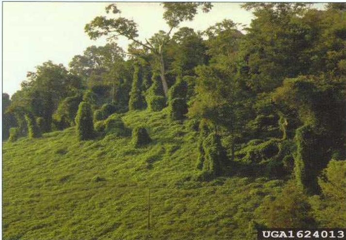
Dense mats of mile-a-minute weed ( Polygonum perfoliatum ) overgrow a forest edge completely covering other vegetation.