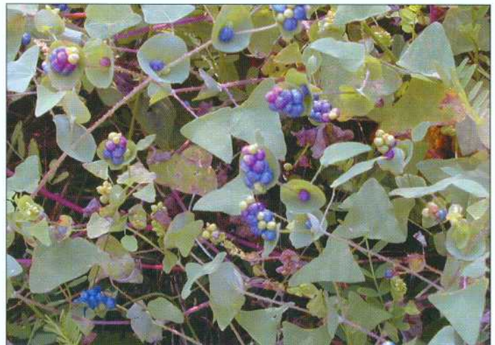
Triangular leaves, recurved barbs, and numerous bright blue fruits make mile-a-minute weed easy to identify.

Mile-a-minute weed varies in height depending on habitat. In open areas, dense mats are formed covering everything including small trees and shrubs. At forest edges, plants climb on other vegetation reaching up to 8 m in height. The light green, triangular leaves, 4 to 7 cm long and 5 to 9 cm wide, are alternately arranged along the stem. The stems are green, turning reddish with age and becoming woody near the base. The main veins, petioles and stems have sharp, recurved hook-like barbs. The ocrea, a saucer shaped sheath 1 to 2 cm in diameter encircles the node. The inflorescence is a spike-like cluster of 10 to 15 tiny white flowers. The fruits resemble blueberries and are 5 mm in diameter, arranged in clusters. Each fruit contains a single round, shiny-black achene. Annual plants have shallow, fibrous roots. In the eastern United States, mile-a-minute weed germinates in full sun in early spring, flowering begins in