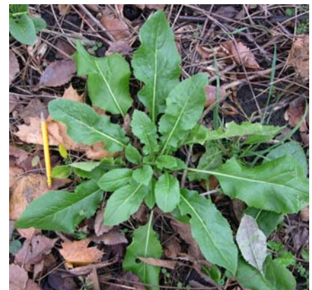
Rosette in fall, first-year plant.