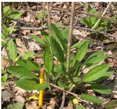
Rosette in spring with last year's dead flower stems.

Plant Habit. First-year plants develop into low rosettes at ground level and stay green all winter. Flowering plants start as a rosette in early spring, but soon send up an erect, 2-4 foot tall flower stem. Flower clusters branch out from the upper parts of the plant. It often grows in extensive