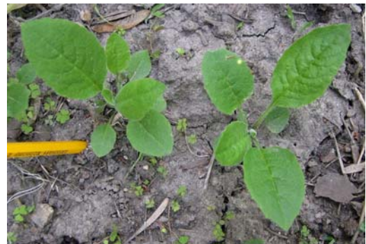
Seedlings in spring.

Hand-pulling or digging flowering plants can be effective, especially in small infestations. Hand pulling alone is usually not practical in large or established patches, but is needed to catch flowering plants missed by other treatments. Plants can be pulled anytime during flowering and up until when seed pods are ready to shatter. Moist, loose soil conditions facilitate pulling. When pulled, stems may break off at the base and the taproot may resprout if not removed. Hand-pulling can increase seed germination through soil disturbance, but this can also expedite depletion of the seed bank. The site should be monitored for several years to eliminate newly emerging plants.