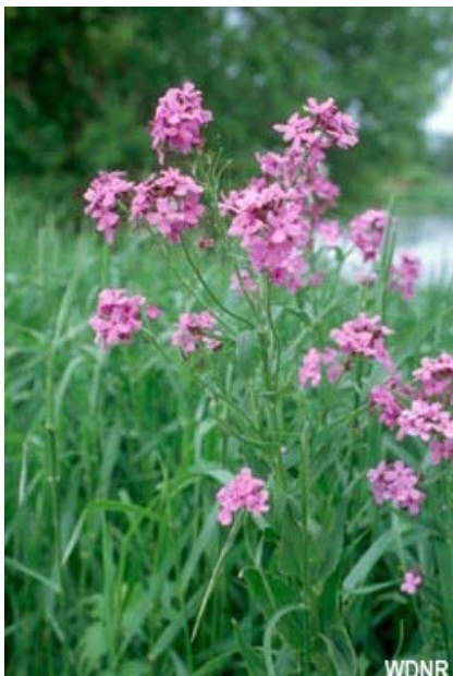
In bloom Dame's rocket (above) closely resembles Phlox

Dame's rocket resembles Phlox – but all phlox species have opposite leaves and 5-petaled flowers. The non-native Garden phlox , Phlox paniculata , is tall, blooms July to September and requires full sun. The native blue-flowered Forest phlox , Phlox divaricata , is smaller (up to 2 feet), grows in denser shade, and blooms April to June. It also resembles another non-native mustard -- Money plant ( Lunaria annua ) – which is grown in gardens and escapes as a weed. Lunaria has large, round, coin-like seed capsules, and leaves that are indented where they join the leaf stalk.