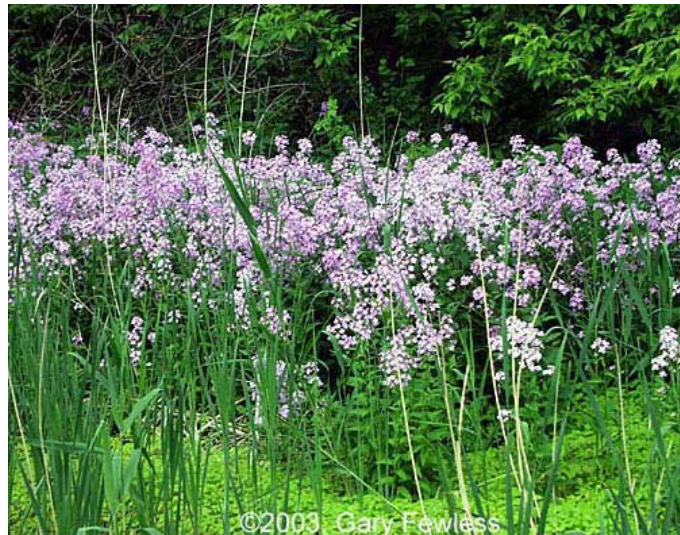
Showy flowers of Dame's rocket