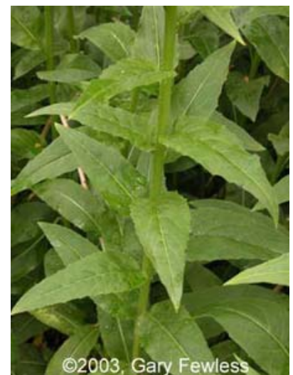
Sharply toothed leaves that decrease in size as they ascend the stem